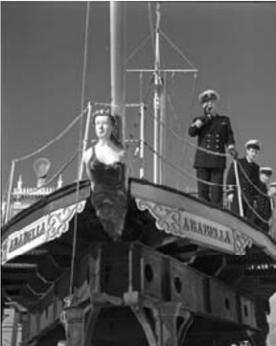
Alec Guinness as the incurably seasick sea captain in Ealing Studios’ hilarious Barnacle Bill.